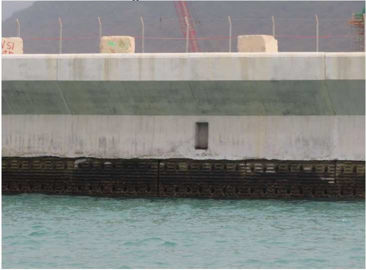
General View of Vertical Eco-shoreline