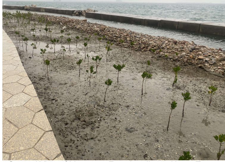
General View of Mangrove Eco-shoreline at Upper Terrace