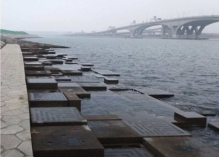
General View of Rocky Eco-shoreline